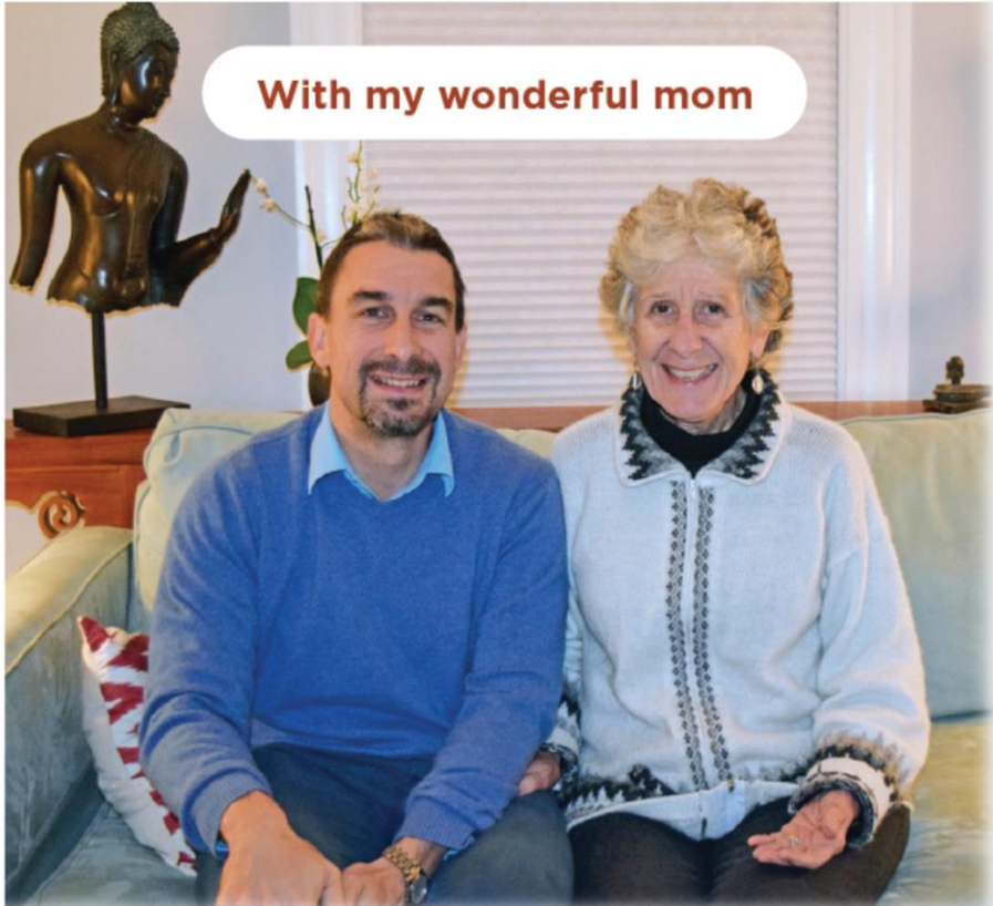
With my wonderful mom