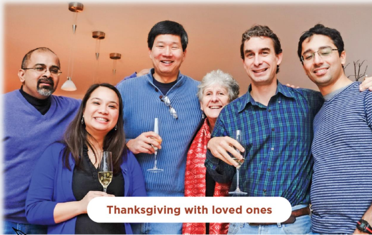
Thanksgiving with loved ones