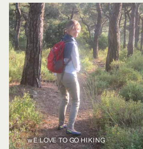
WE LOVE TO GO HIKING

We hope next year's travels will include our child.