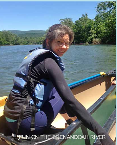
FUN ON THE SHENANDOAH RIVER