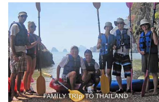
FAMILY TRIP TO THAILAND

course, we can't wait for the day when we are planning our annual family trip around our son or daughter.