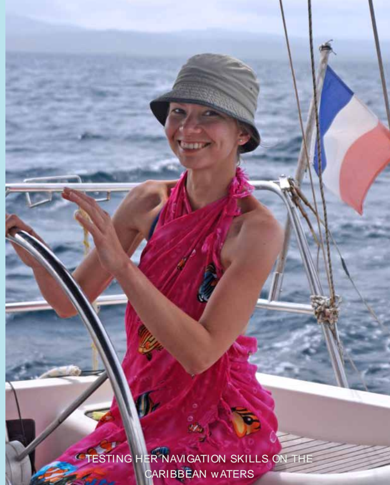
TESTING HER NAVIGATION SKILLS ON THE CARIBBEAN WATERS