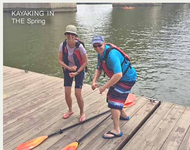
KAYAKING IN THE Spring