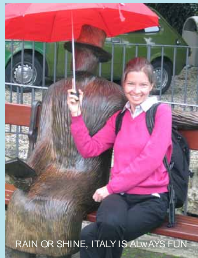
RAIN OR SHINE, ITALY IS ALWAYS FUN