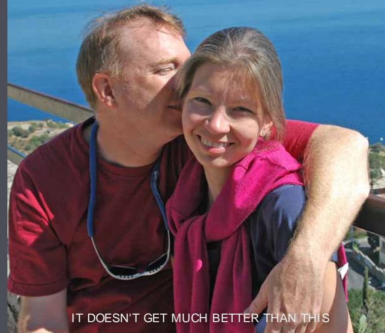
IT DOESN'T GET MUCH BETTER THAN THIS