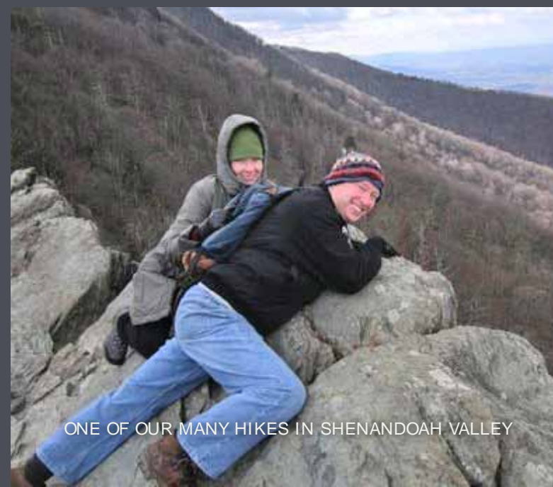
ONE OF OUR MANY HIKES IN SHENANDOAH VALLEY