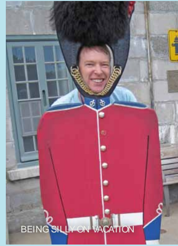
BEING SILLY ON VACATION