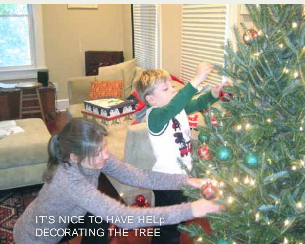
IT'S NICE TO HAVE HELP DECORATING THE TREE